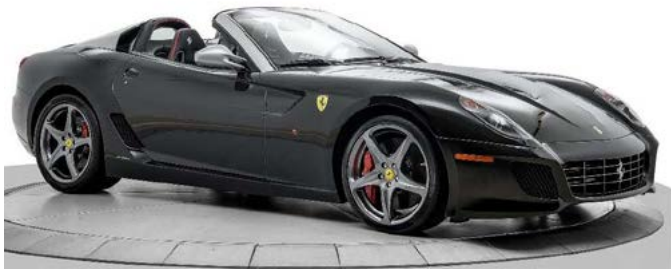
Lot #1 - Mint 2011 599 SA Aperta with just over 200 miles

These highly desirable automobiles are some of the assets seized by IRS-CI as part of the $2 billion