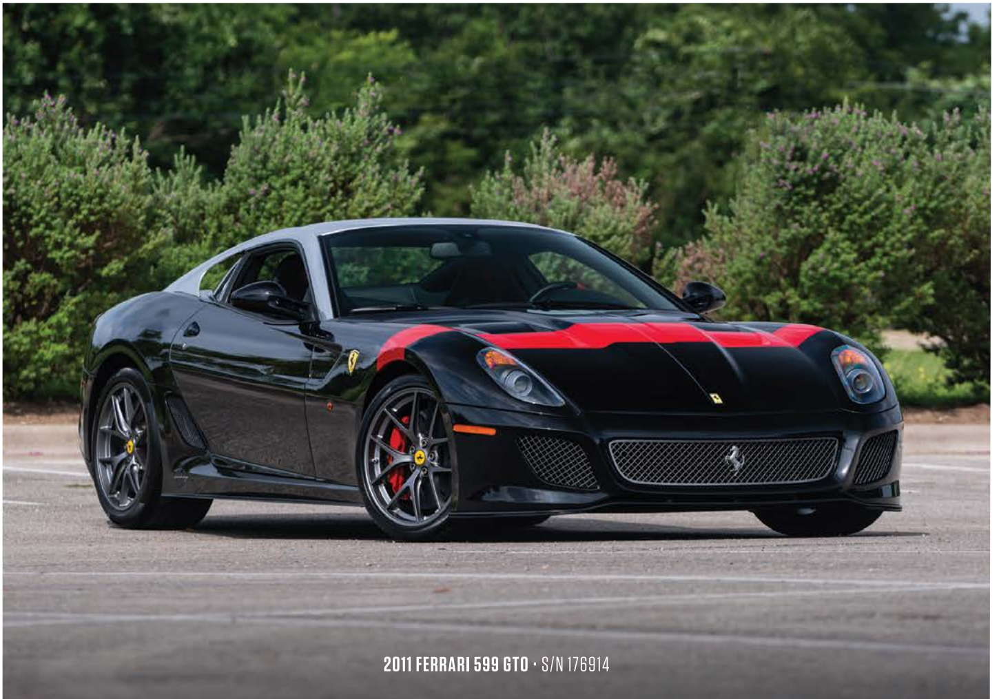
2011 FERRARI 599 GTO • S/N 176914

HYATT REGENCY MONTEREY HOTEL & SPA • DEL MONTE GOLF COURSE • MONTEREY, CA