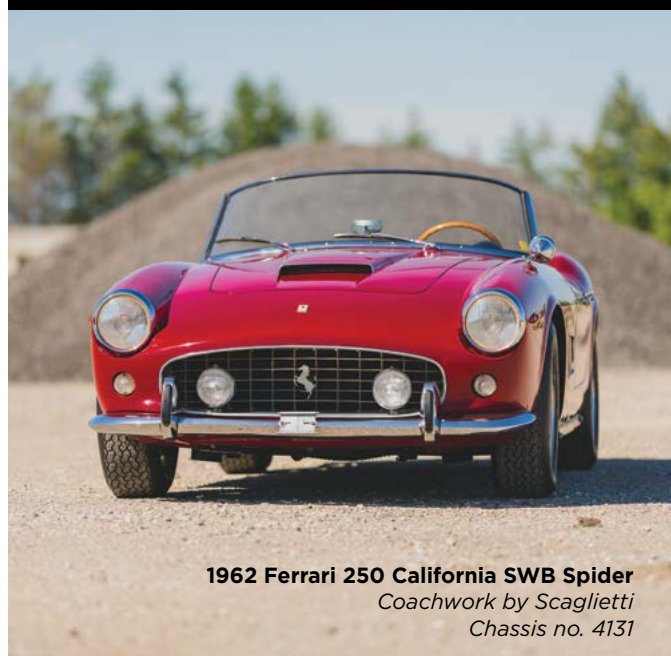
1962 Ferrari 250 California SWB Spider Coachwork by Scaglietti Chassis no. 4131

A THREE-DAY AUCTION FEATURING OVER 30 EXCEPTIONAL FERRARI HIGHLIGHTS