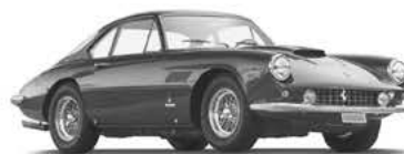
1962 FERRARI 400 SUPERAMERICA SERIES I COUPE AERODINAMICO The 1962 Geneva Motor Show Car | Preservation Award Winner at the 2019 Cavallino Classic | Ferrari Classiche Certified | Coachwork by Pininfarina | Chassis 3361 SA