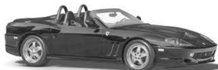
2001 FERRARI 550 BARCHETTA Rare Black over Black Color Scheme | One of Only 448 Examples Built | Coachwork by Pininfarina