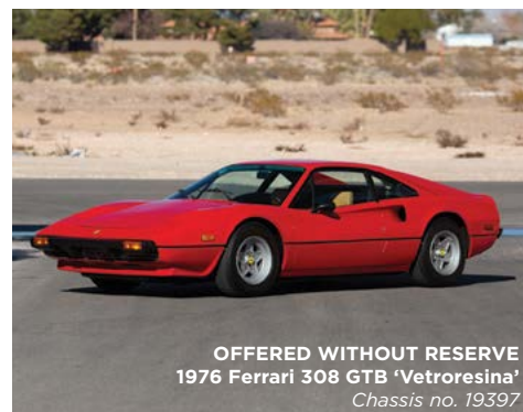
OFFERED WITHOUT RESERVE 1976 Ferrari 308 GTB 'Vetroresina' Chassis no. 19397