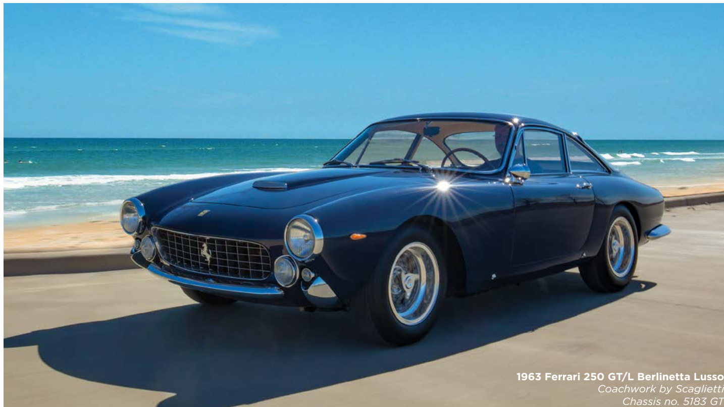
1963 Ferrari 250 GT/L Berlinetta Lusso Coachwork by Scaglietti Chassis no. 5183 GT