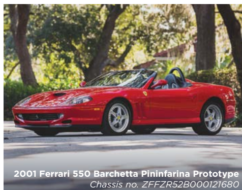
2001 Ferrari 550 Barchetta Pininfarina Prototype Chassis no. ZFFZR52B000121680