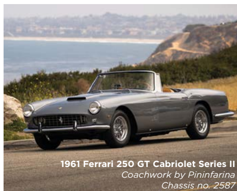
1961 Ferrari 250 GT Cabriolet Series II Coachwork by Pininfarina Chassis no. 2587