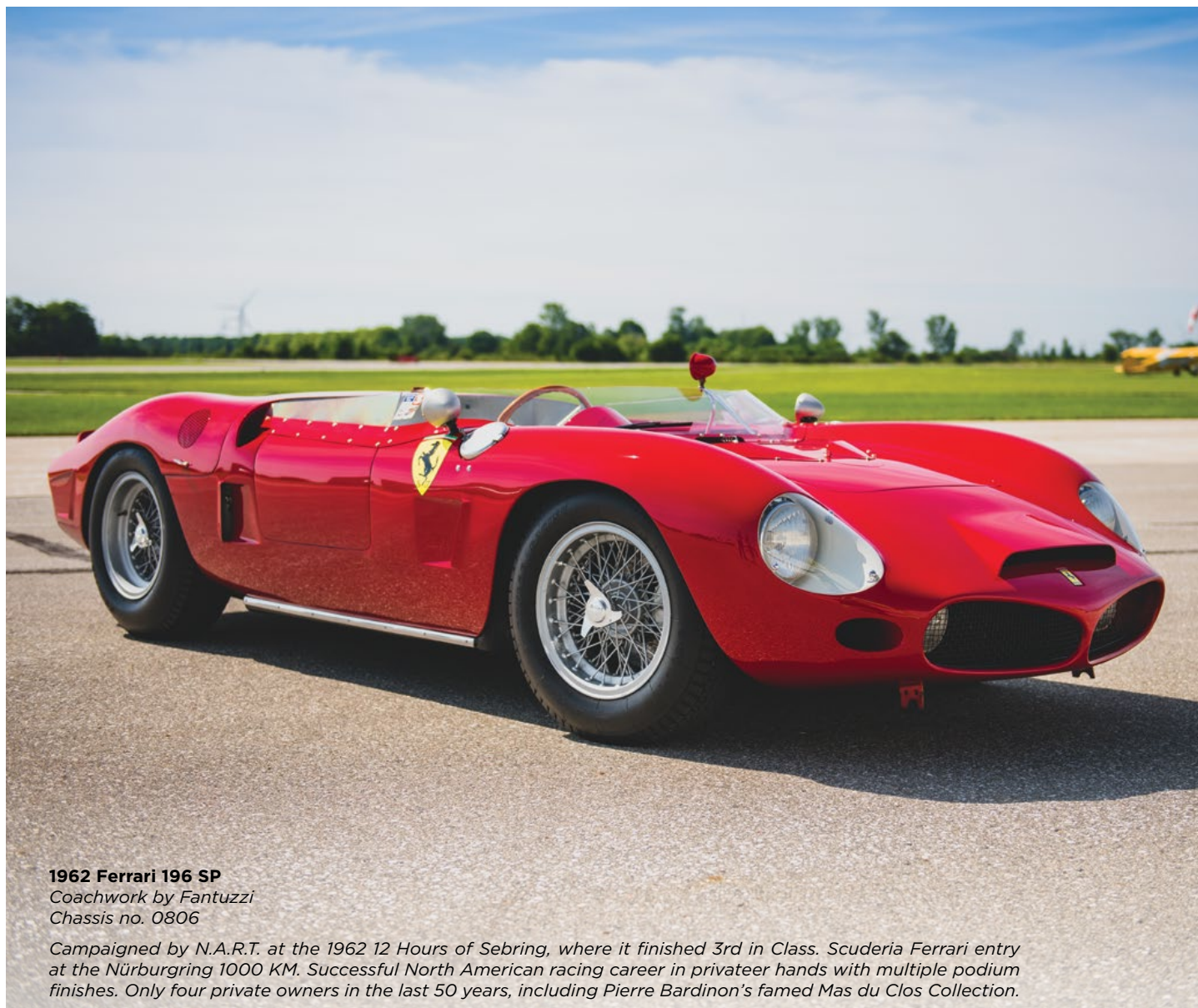
1962 Ferrari 196 SP Coachwork by Fantuzzi Chassis no. 0806