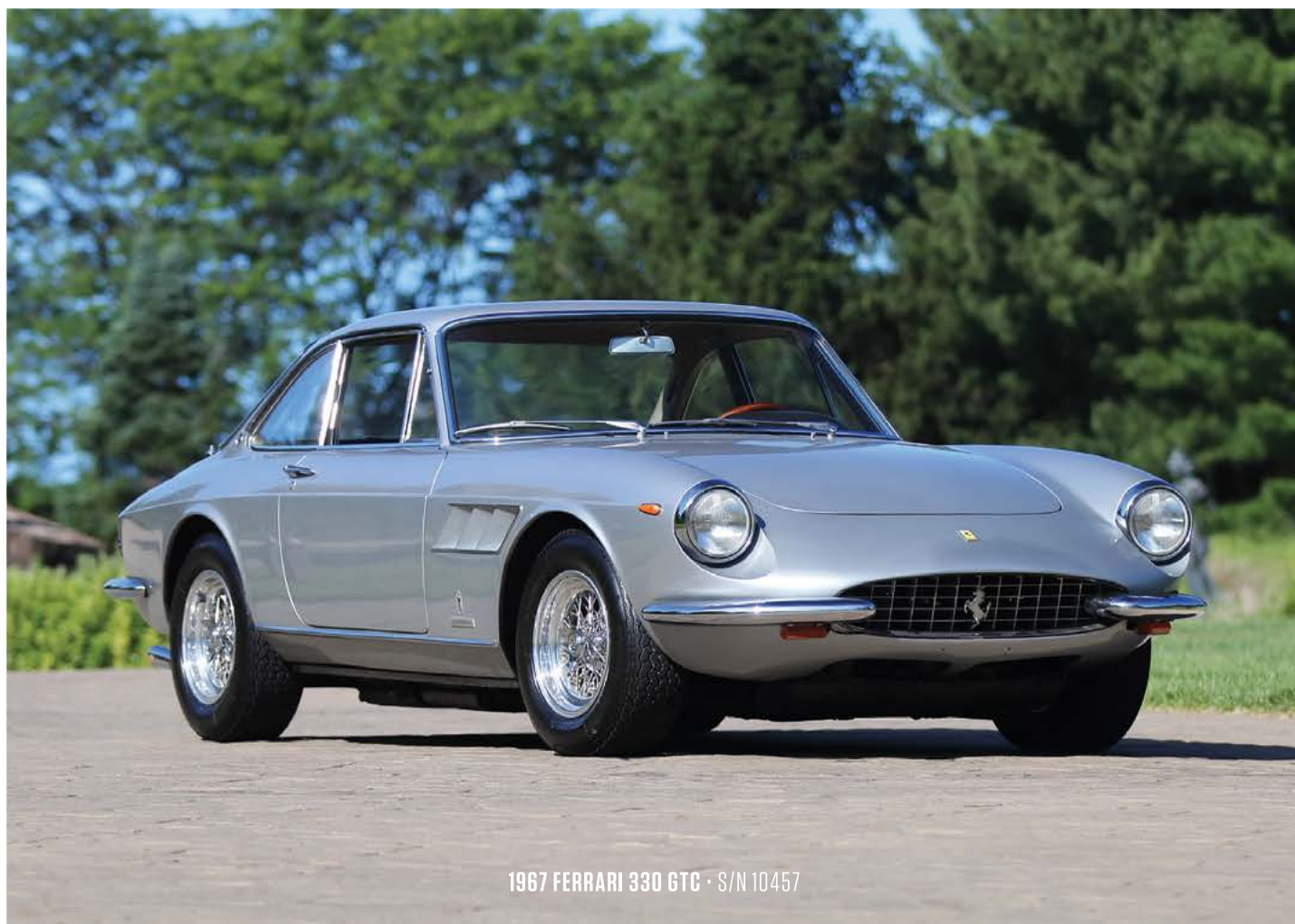
1967 FERRARI 330 GTC • S/N 10457

HYATT REGENCY MONTEREY HOTEL & SPA • DEL MONTE GOLF COURSE • MONTEREY, CA