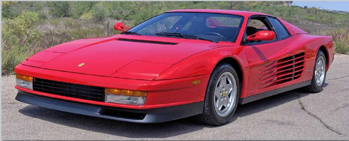
1990 Testarossa, VIN ZFFSG17A1L0085381

Foreign Cars Italia, Greensboro, NC, www.foreigncarsitalia.com , 855-400-2629