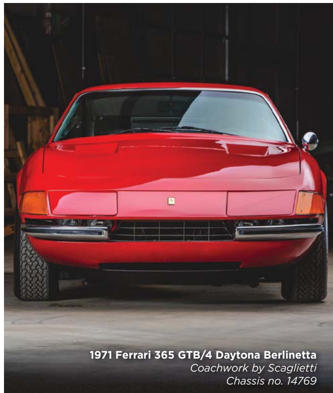
1971 Ferrari 365 GTB/4 Daytona Berlinetta Coachwork by Scaglietti Chassis no. 14769