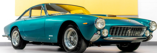
1963 FERRARI 250GT LUSSO - #5117 30,278 KMS (18,813 MILES)

175TH OF 351 BUILT - PINO VERDE ON TOBACCO CLASSICHE RED BOOK. PLATINUM AWARD WINNER FCA. EXTENSIVE DOCUMENTATION. OWNED AT ONE POINT BY REGGIE JACKSON.