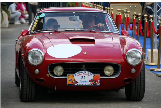
250 GT SWB, S/N 1791 GT

Several other interesting racing cars could be seen: a nice yellow 250 GT Boano, S/N 0541 GT, with competition features and coming from Switzerland, a fantastic 250 GT SWB Competizione with alloy body and coming from Italy (Corrado Cupellini's S/N 1791 GT) and a 250 GTO replica, based on 250 GTE, S/N 4243 GT.