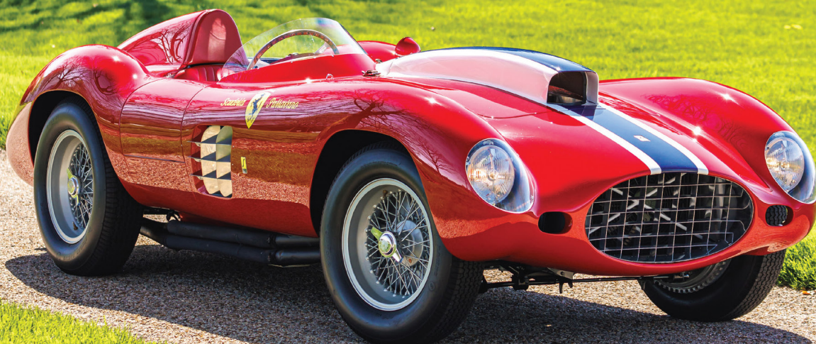
1955 Ferrari 410 Sport Spider by Scaglietti Estimate: In Excess Of $15,000,000 USD