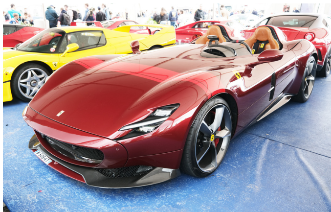
Monza SP2, S/N 258370

A very nice selection of iconic vehicles was presented to a large and enthusiastic public : Mercedes 300 SL roadster, several Bugattis (Tank, Type 50...), Hispano-Suizas, Rolls-Royce Silver Cloud Drophead Coupé, Delage D8, Aston Martin DB2/4, Facel-Vega, Invicta, Peugeot Darl'mat, etc.