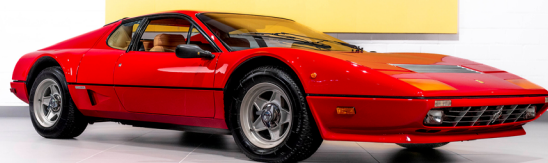
1984 FERRARI 512 BBi 15,856 MILES

175TH OF 351 BUILT - PINO VERDE ON TOBACCO CLASSICHE RED BOOK. PLATINUM AWARD WINNER FCA. EXTENSIVE DOCUMENTATION. OWNED AT ONE POINT BY REGGIE JACKSON.