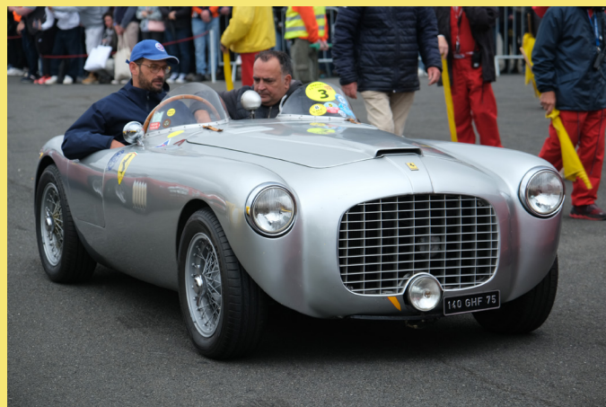
1950 212 Export, S/N 0094 E

For example, two famous Ferrari collectors from South of France brought each, more than five of the cars from their impressive collection.