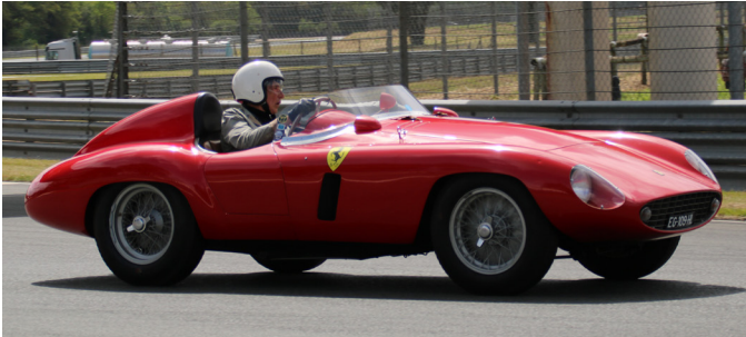
735 Sport, S/N 0446 M/0556 MD

tioned, three other vintage Ferrari racers represented the early glory years of the Ferrari racing teams in the 1950s: S/N 0198 ET, a 225 S Export Spyder by Vignale coming from Germany, S/N 0294 AM, a 340 MM Spyder coming from Italy (and a regular entrant at Sport & Collection events), and a very rarely seen gem coming from Alsatian French area, the 735 S Spyder by Scaglietti, S/N 0446 M/0556 MD.