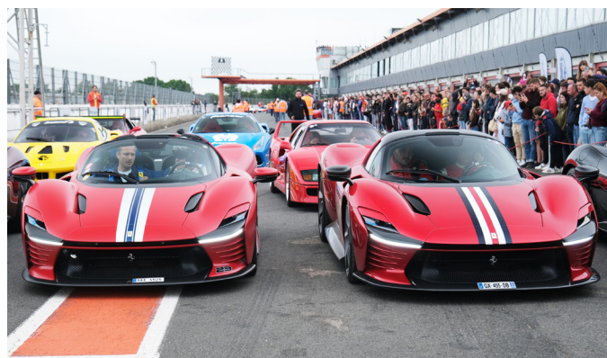
Daytona SP3, S/N 290745 and 303669

A replica plane of Francesco Baracca's Spad VII (whose 'Cavallino Rampante' logo became the Ferrari one) flight over the parade releasing smoke in the colours of Italy. And the Patrouille de France planes finally managed to close the event despite uncertain weather.