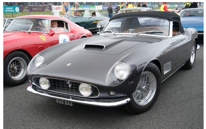
250 GT LWB Spyder California, S/N 1057 GT

Best of Show went to an exceptional car, bought from the "W Collection" by its new owner just two weeks before at Monaco Artcurial auction: the Ferrari 250 GT LWB Spyder California, S/N 1057 GT.