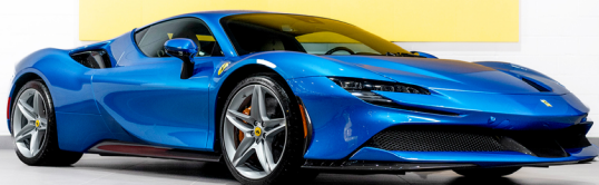
2022 FERRARI SF90 STRADALE 564 KMS (350 MILES)

ROSSO CORSA ON BEIGE, MAJOR ENGINE OUT SERVICE PERFORMED IN 2021 AT 15,779 MILES AND IN 2015 AT 9,575 MILES