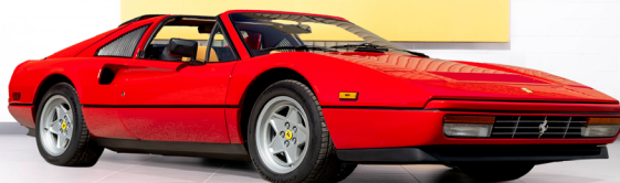
1987 FERRARI 328 GTS 29,293 KMS (18,202 MILES)

BLUE CORSA WITH SAVIA INTERIOR, SPECIAL ORDER: FIORANO W/ STRIPE DELETE