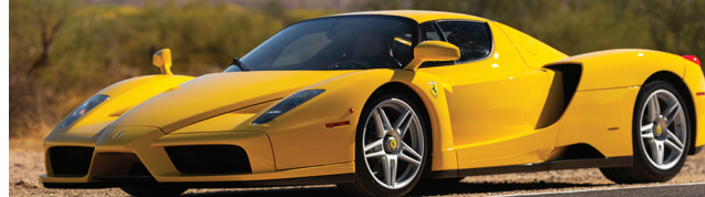
2003 Ferrari Enzo Chassis no. ZFFCW56A83013119

Featured as the cover car for Car and Driver's July 2003 issue