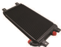
Enzo Oil Cooler