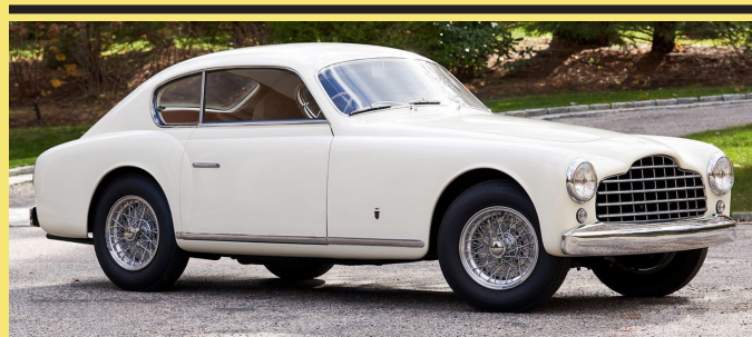
195 INTER GHIA COUPE, S/N 0129S (1951).

145 of the 270 auction lots at Amelia Island are reported in detail at rickcarey.com .