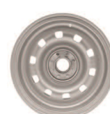
275 14" Wheel Set