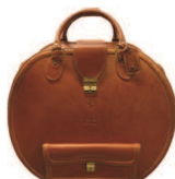
Ferrari Luggage & Tools (inc. F40, F50, 288, Enzo)