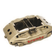
F40 LM Calipers