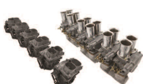
Weber 40DCN9 & 40DCN14 Carb Set

Additional parts can be viewed at: www.dke.co.uk/parts