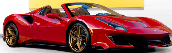
2019 FERRARI 488 PISTA SPIDER $719,995 USD 4,001 KMS (2,500 MILES)

BLU MONTREAL ON CARMINIO LEATHER BY POLTRONA FRAU, TAILOR MADE SPECIFICATIONS WITH PLAQUE 'WHAT'S BEHIND YOU DOESN'T MATTER' & SIGNED BY FERRARI FACTORY TEAM ON ENGINE COVER