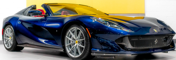
2022 FERRARI 812 GTS $609,995 USD 336 KMS (210 MILES)

ROSSO CORSA ON BEIGE, MAJOR ENGINE OUT SERVICE PERFORMED IN 2021 AT 15,779 MILES AND IN 2015 AT 9,575 MILES