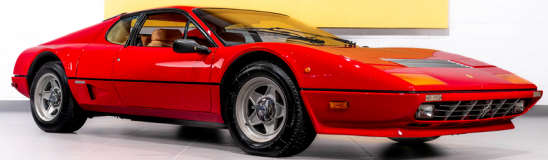
1984 FERRARI 512 BBI $428,475 USD 15,856 MILES

175TH OF 351 BUILT - PINO VERDE ON TOBACCO CLASSICHE RED BOOK. PLATINUM AWARD WINNER FCA. EXTENSIVE DOCUMENTATION. OWNED AT ONE POINT BY REGGIE JACKSON.