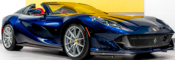
2022 FERRARI 812 GTS $609,995 USD 336 KMS (210 MILES)

ROSSO CORSA ON BEIGE, MAJOR ENGINE OUT SERVICE PERFORMED IN 2021 AT 15,779 MILES AND IN 2015 AT 9,575 MILES